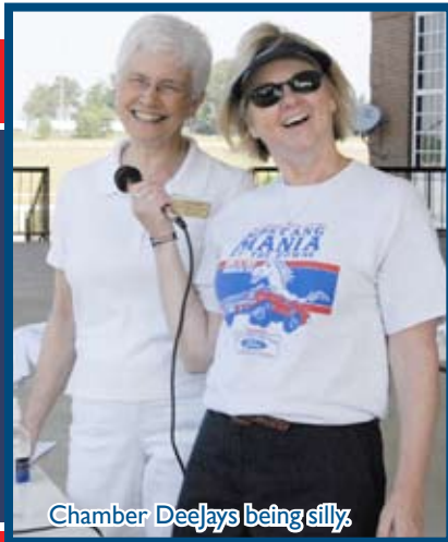
Chamber Deejays being silly.