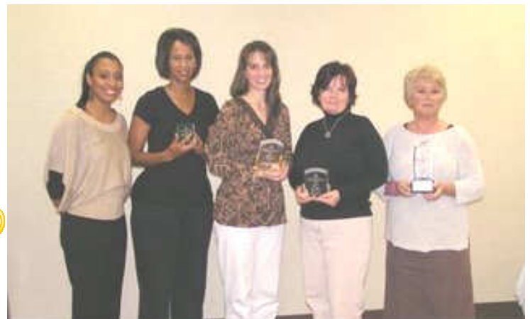
2008 National Business Women's Week BPW Award Winners