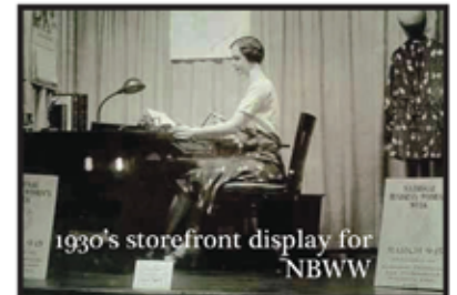
1930's storefront display for NBWW