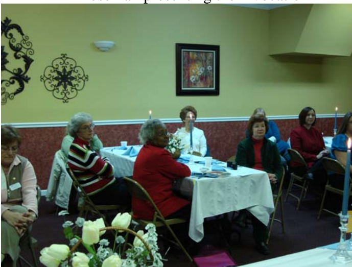
Members in attendance