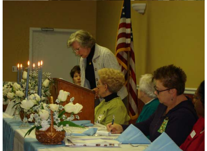
Wonder what was going on at the head table!!