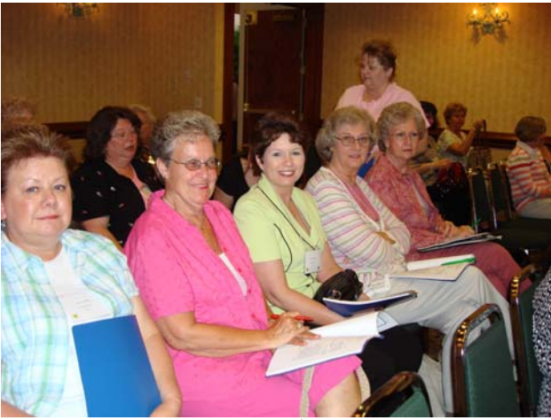
Friday's State Conference 1 st Business Session