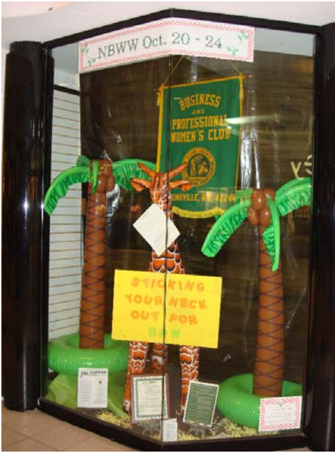
Window display at Bradford Square Mall for NBWW Week. Theme: "Sticking Your Neck Out For BPW"