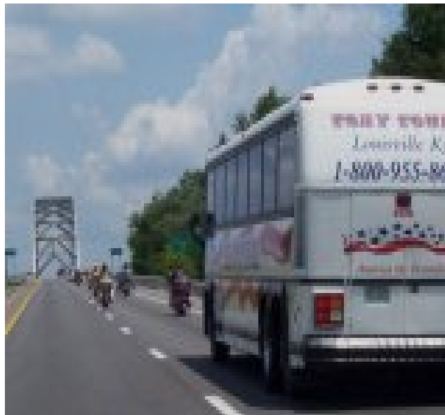
Escort for Paducah Soldiers

The group's mission quickly expanded to include the funerals of law enforcement officers, fire department personnel, all first responders, and any active duty member or veteran of the U.S. Armed Forces from all previous wars and conflicts and is now largely focused on recognizing and honoring the sacrifices of fallen service members as well as their families and loved ones. As of August 2010, PGR reported over 201,000 members. In addition to their attendance at funerals, the group also greets troops returning from overseas at welcome home celebrations, and deployment ceremonies. The group also assists families in financial difficulties with travel and housing arrangements, and also visits military hospitals to encourage and honor wounded service members of the United States Armed Forces. (Wikipedia)